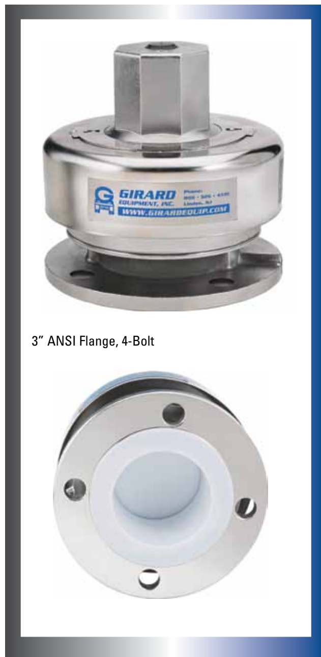
3" ANSI Flange, 4-Bolt